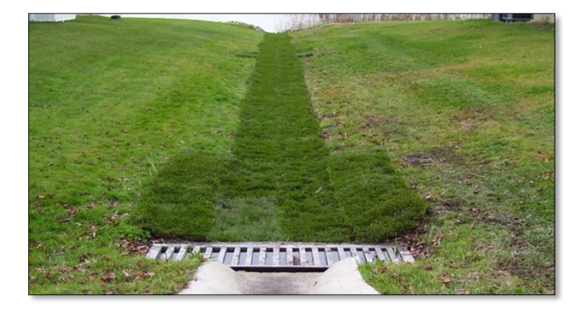
A bioswale is a stormwater best management practice.